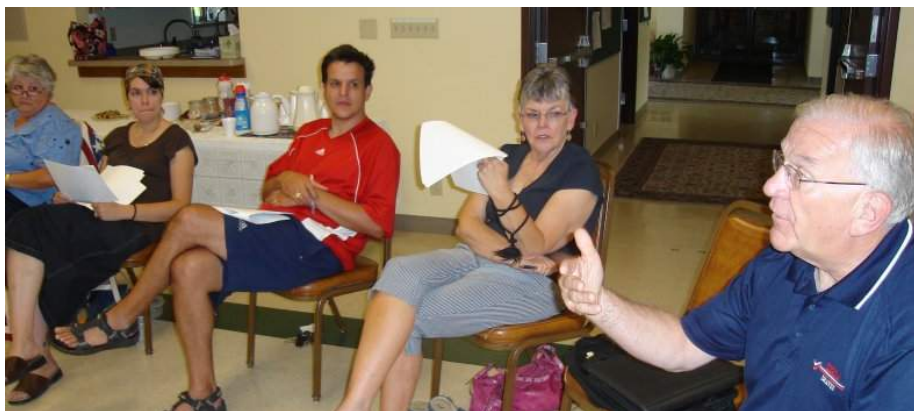
Figure 5 A primary value of the inventory may be as a framework for conversation and dialogue. Here a parish group discusses one section of the inventory model.

Pastoral transitions - Prior to placing/receiving new pastors, parishes may want to assess their status, where they desire to head and to openly share these ideas with new clergy.