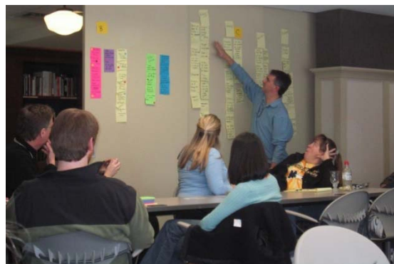
Figure 6 . A parish team organizes improvement ideas to determine which have the greatest impact while not overtaxing the community's ability to put them into practice.