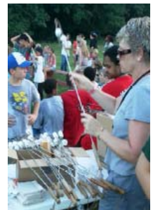
Figure 3 Healthy parishes socialize and celebrate.

A new commandment I give to you: that you love one another, as I have loved you, so you must love one another. By this all will know that you are My disciples, if you have love for one another." John 13:34-35