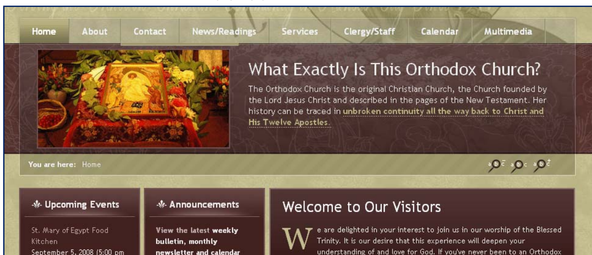
Figure 4 Parish websites are important tools for communicating awareness of a parish.