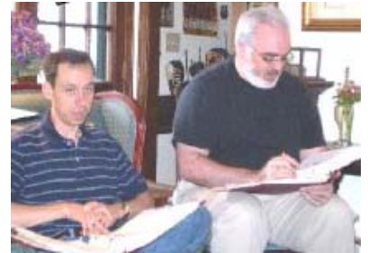
Figure 2 A parish ministry group develops plans for upcoming year.