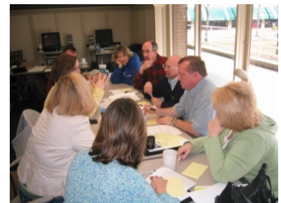
Figure 1 A primary value of the inventory may be as a framework for conversation and dialogue.

The model then is one view but far from the only view of healthy Orthodox parish life. It is, we hope, a starting point for a valuable parish conversation.